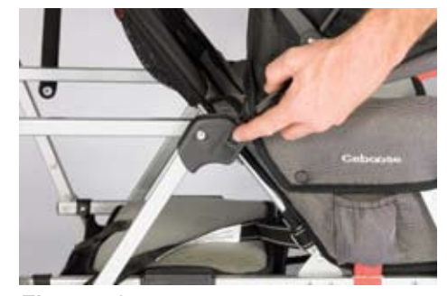
Figure 12 Figure 13